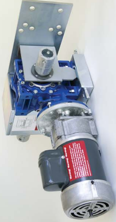
VC 2000 Vent Drive