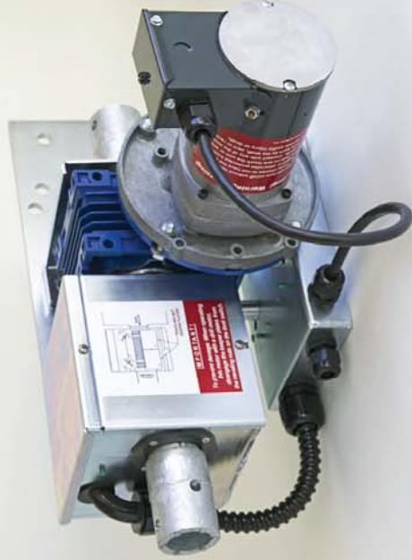
VC 100A Vent Drive

Take advantage of Wadsworth's 40 plus years of experience in automating vents. Our drive units set the standard for powerful performance, smooth operation and reliability.